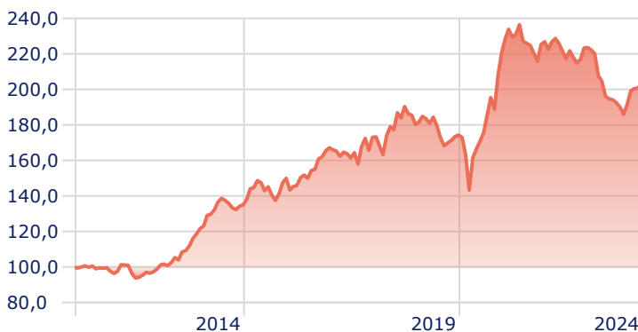
■Norron Select R