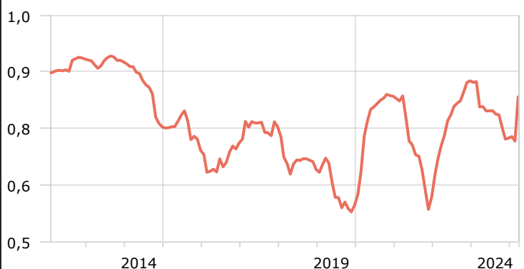
■Norron Select R

Rolling Window: 1 Year 1 Month shift Calculation Benchmark: MSCI Nordic Countries GR LCL