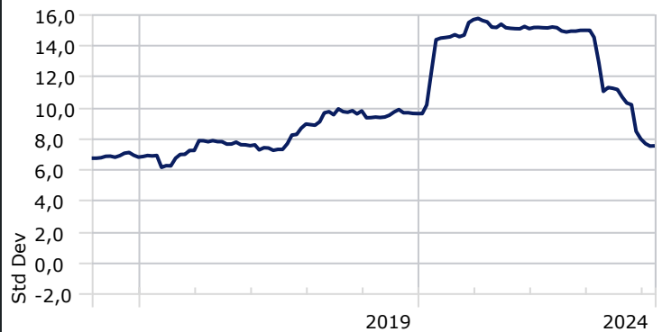
■Norron Select R

Rolling Window: 3 Years 1 Month shift Calculation Benchmark: None